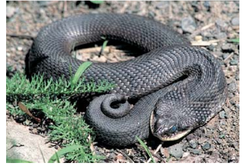
Eastern hognose snake