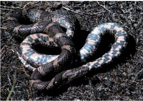
Eastern milk snake