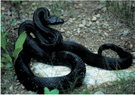
Black rat snake