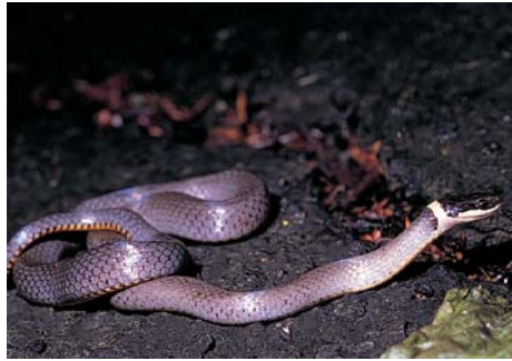
Northern ringneck snake