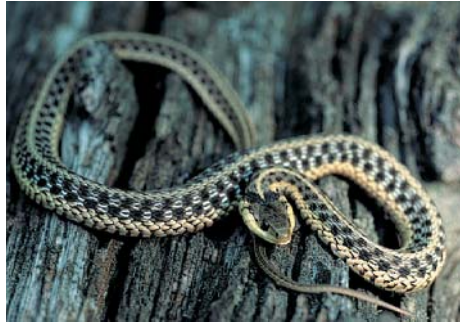
Common garter snake