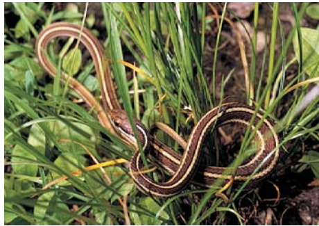
Eastern ribbon snake