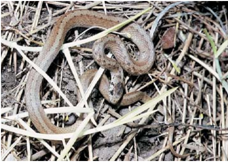
Northern brown snake