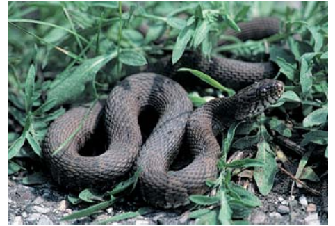
Northern water snake