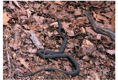
Northern black racer